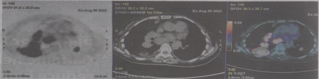
A digital PET/CT scanner allows for faster scans, reduces dosage radioisotopes use and improves lesion detection compared to older analogue PET/CT scanners.

Among the latest developments in nuclear medicine is theranostics, short form for therapeutic diagnostics, that utilises the same or similar pharmaceuticals. By attaching it to a particular radioisotope, doctors can diagnose a particular cancer and determine if it will respond to nuclear medicine therapy by employing another radioisotope to